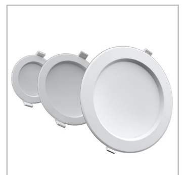
INDU DOWNLIGHT is available in 3 sizes, each offering a typical lumen output.