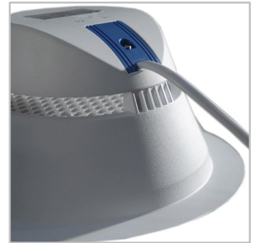
The design offers an optimal heat dissipation for long-lasting performance.

INDU DOWNLIGHT also provides high visual comfort. It delivers a neutral white light with a high colour rendering index (CRI 80).