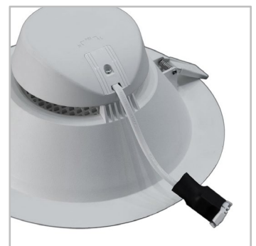
The quick electrical connection is performed at the back of the luminaire.