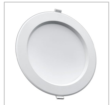
The fire-resistant INDU DOWNLIGHT complies with the strictest indoor safety regulations.